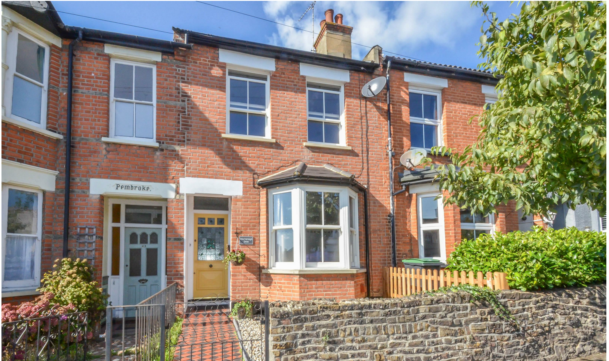
Fairleigh Drive, Leigh £1,695 PCM